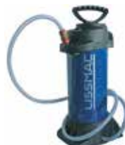
[ 3 ] Water pressure tank