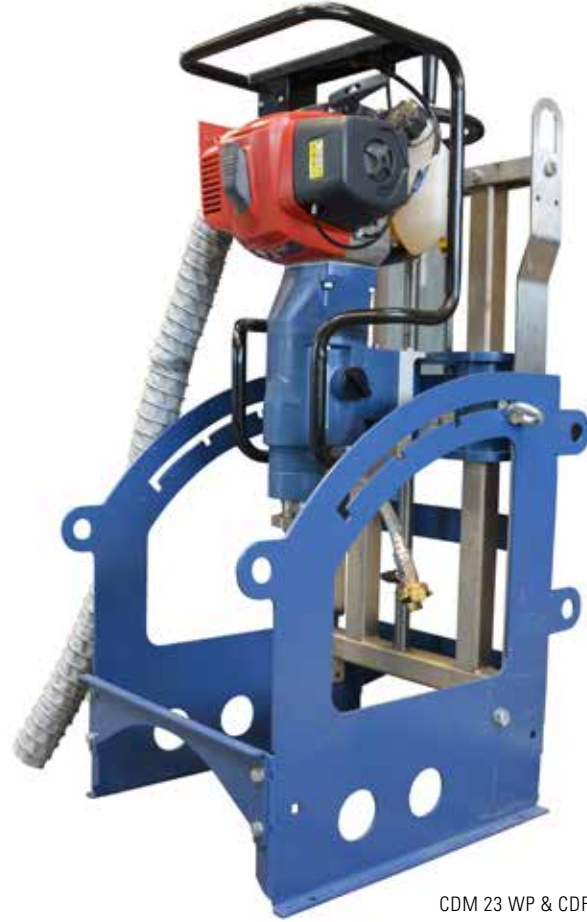
CDM 23 WP & CDR 350