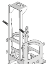
[ 2 ] Digger shovel frame