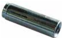
[ 5 ] Anchoring dowels