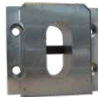
[ 3 ] UNIVERSAL quick-clamping motor plate