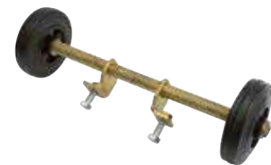
[ 4 ] Wheel set