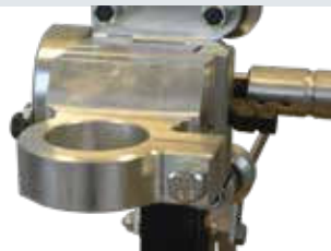
[ 2 ] Clamping collar holder