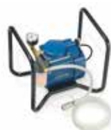
[ 6 ] Vacuum pump