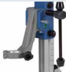
[ 2 ] Collar