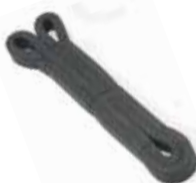
[ 5 ] Vacuum sealing ring