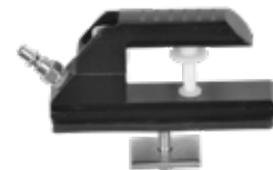
[ 4 ] Vacuum cover