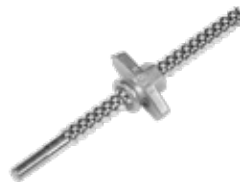
[ 3 ] Quick-clamping spindle M12