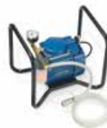
[ 7 ] Vacuum pump