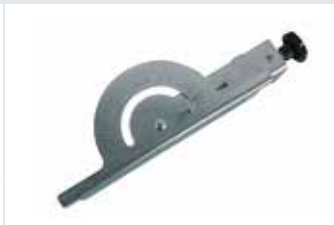
[ 2 ] Side stop