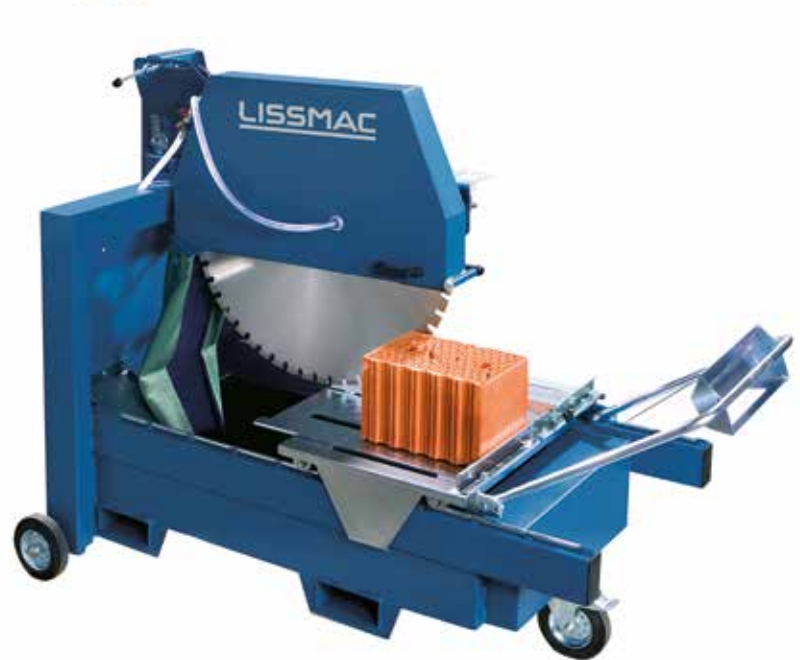
DTS 1000 H