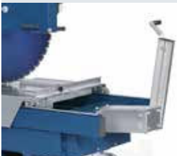
[ 1 ] DTS 1000 V