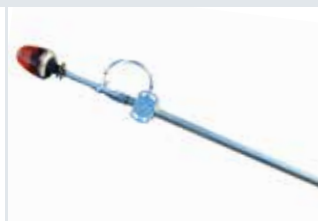
[ 3 ] Warning flasher