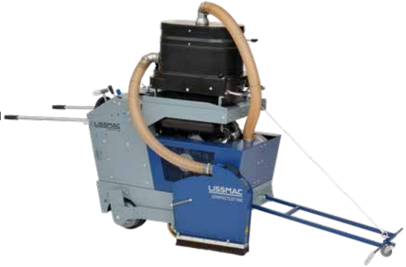
COMPACTCUT 900 P/T