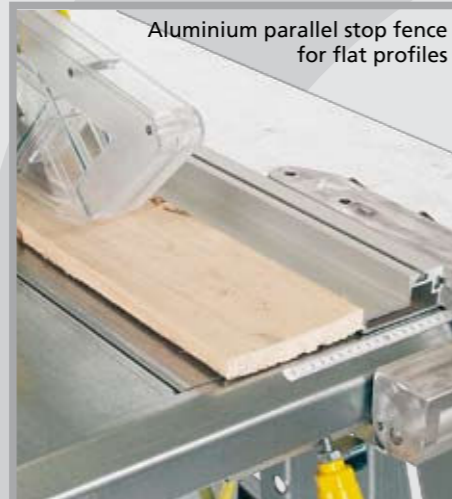
Aluminium parallel stop fence for flat profiles