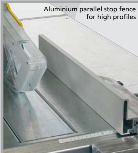
Aluminium parallel stop fence for high profiles