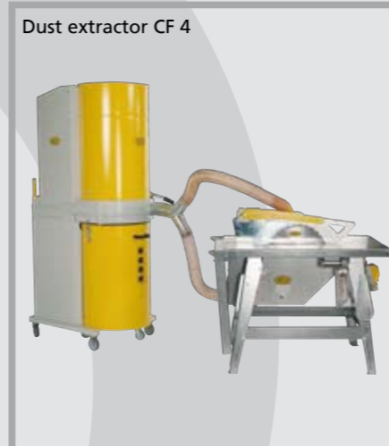
Dust extractor CF 4