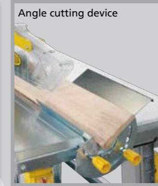
Angle cutting device

The self-opening and closing function of the safety hood leads to a significant reduction in the risk of accidents.