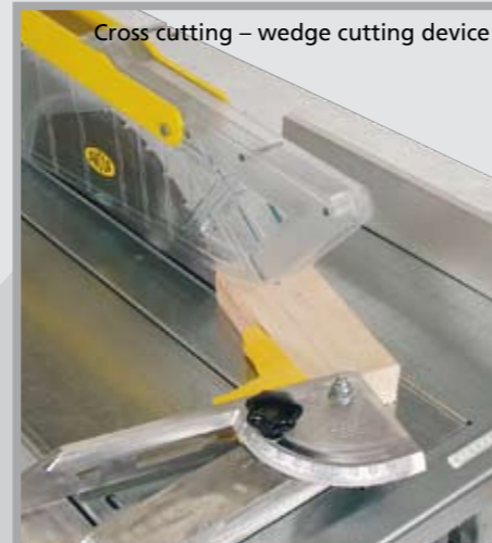
Cross cutting – wedge cutting device