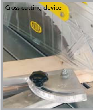
Cross cutting device